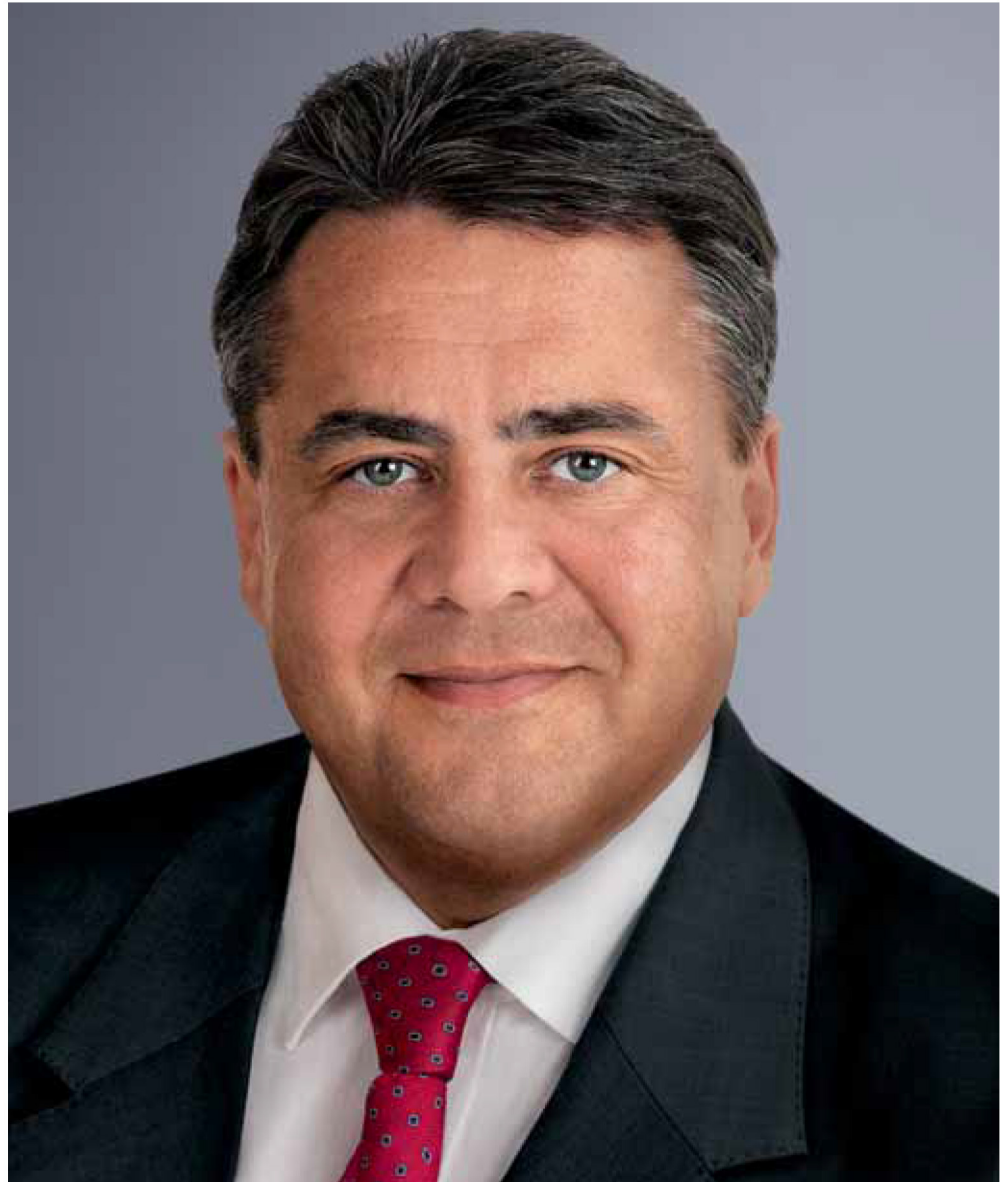
H.E. Sigmar Gabriel, Vice Chancellor and Minister for Economic Affairs and Energy

On 8 th September 2014, the German Near and Middle East Association celebrated its 80 th anniversary in a festive setting with around 500 guests from the world of business, diplomacy and politics. Having established and supported strong economic relations between the Federal Republic of Germany and the Near and