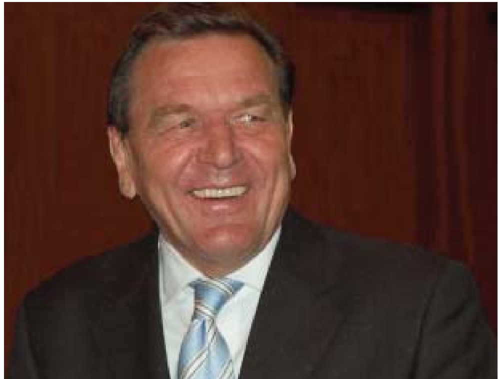
H.E. Dr. Gerhard Schröder, former Chancellor of the Federal Republic of Germany and Honorary Chairman of NUMOV

The tables were soon abuzz with lively conversation, which only seized for the speeches of the evening. Initially, all guests were warmly