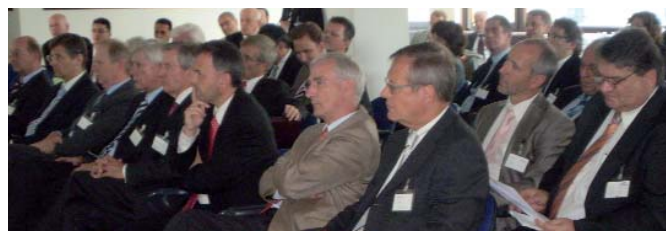
Participants of the conference

After further discussion of some of the points raised by the speakers, the conference concluded with an expression of gratitude for all the panellists. Their contributions had provided the participants of the conference with food for thought and a greater understanding of the role that an increasingly integrated European Union is playing as a partner of the Near and Middle East.